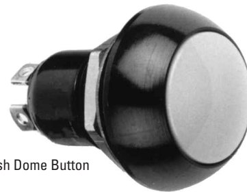
Flush Dome Button