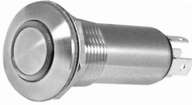
High Profile Curved Button

The LP5-V series is an alternate action switch that has been designed to provide attractive, lighted position indication for applications in harsh environments, where security and reliability are paramount. The series features both aluminum and stainless steel cases watertight to IP68S. Momentary action is available in the LP3-V series.