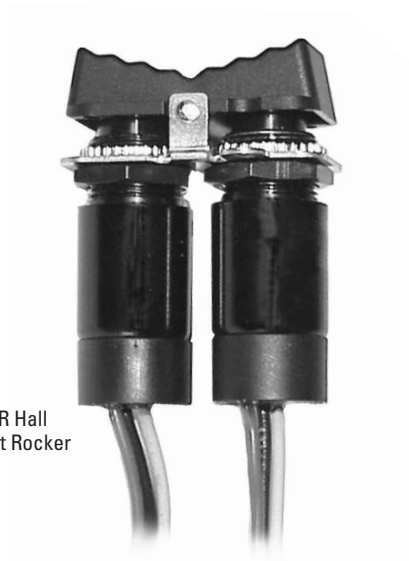
HPL-R Hall Effect Rocker