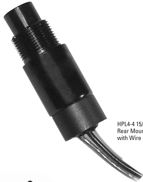
HPL4-4 15/32" Thread Rear Mount shown with Wire Leads

The HPL is offered as a stand-alone switch and in a dual HPL rocker assembly. As with all OTTO switches, a wide variety of case and button styles and colors are offered, along with various termination styles and two levels of sealing. OTTO can provide custom configurations as well as provide the HPL switches installed in a control grip.